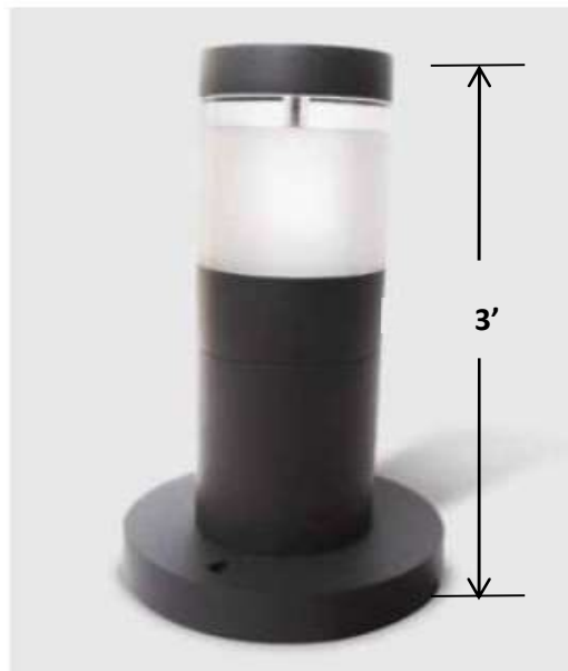
Fig No.2 LED Bollard Light